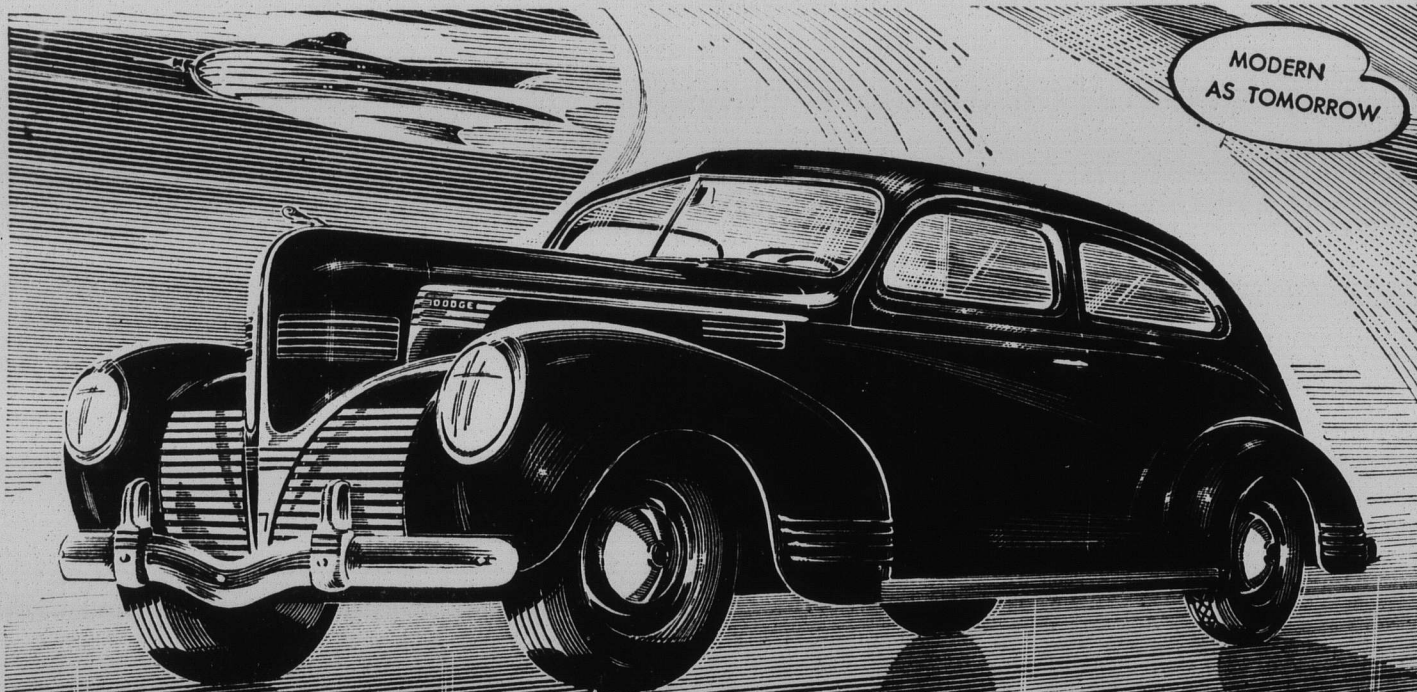
DODGE LUXURY LINER SPECIAL SEDAN, $815 DELIVERED IN DETROIT All Federal Taxes Included—Spare Tire and Wheel and All Standard Equipment Included