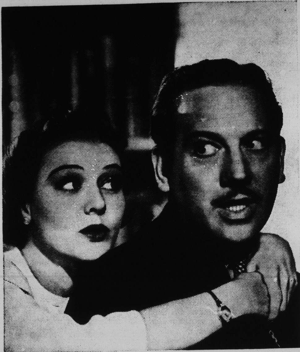
"Hey! Watch What You're Doin'!"

..... Says Melvyn Douglas as Florence Rice nonchalantly wraps her arms around his neck. This is a scene from their new co-starring picture, "Fast Company," a rapid first comedy-mystery. Douglas is currently seen in "Toy Wife," with Luise Rainer and Robert Young.