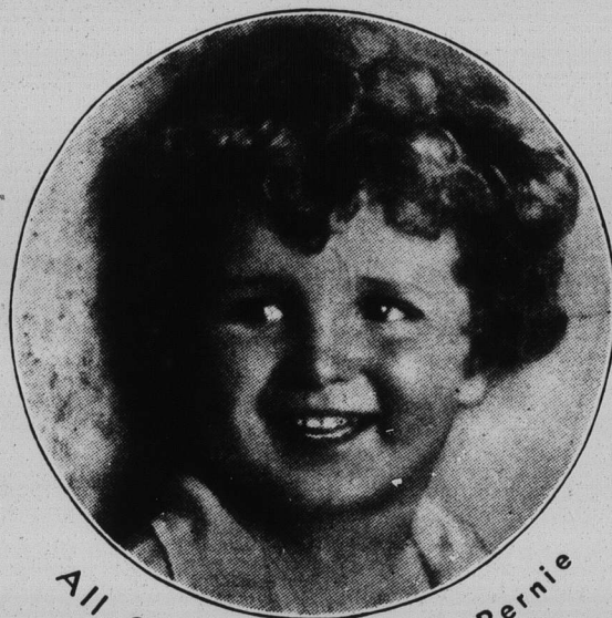
All Children Smile for Bernie

Photographs Accepted Only From The Bernie Studio . . . Exclusive Contest Photographer