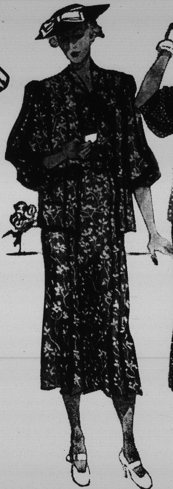
Crystal Sheer Bembergs $15

Dark printed sheers keep the sun from becoming too annoyingly warm. And these charming jacket frocks will be appropriate for wear in town or on your vacation as long as warm weather lasts. Blue, brown, black, grey, navy and other dark shades with dainty white prints. Sizes 36 to 44, 16½ to 24½.