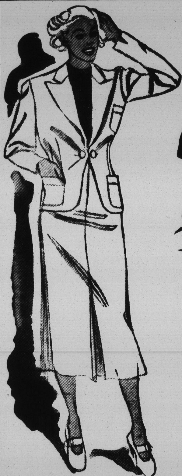
Palm Beach Suit $17.50

Chalk white tailored suit in this favorite summer suiting. Amazing wrinkle resistance, cool and porous, single-breasted with straight or half belted back and link button closing, or double-breasted. Kover-Zip skirt closing, Earl-Glo lining in sleeves. This is a suit year and you can carry your liking for classic simple tailoring into the summer. Sizes 12-20.