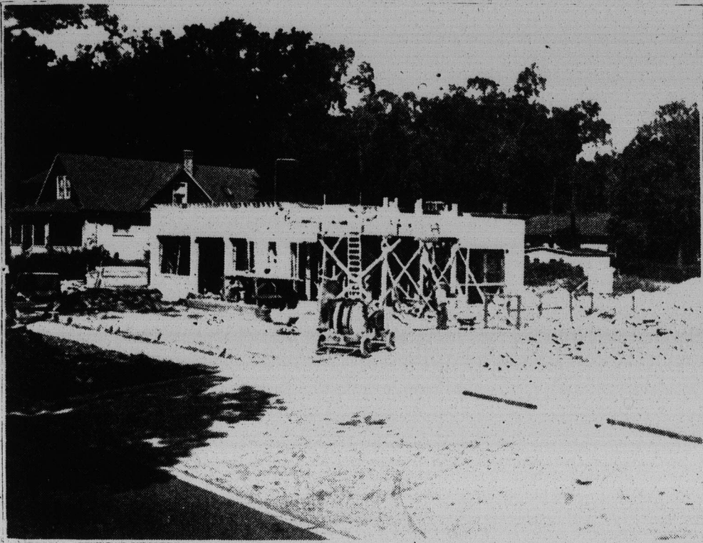
Work is progressing rapidly on construction of Stephen Shimonek's very complete automobile service station located on Main street at Lake avenue, Wilmette. The structure will be of Wisconsin Lannen stone which is used effectively on some of the finest residences and churches in this vicinity. It will have a Ludowici hand made tile roof.

Both in design and materials employed, this building will reflect credit upon the neighborhood which is principally residential in character. Mr. Shimonek has spared no expense to establish a building that is compact, complete in every detail, and of the best type obtainable.