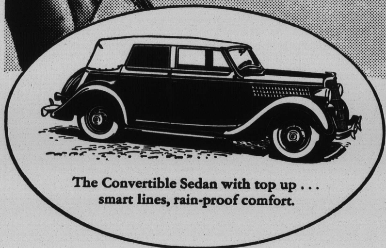
The Convertible Sedan with top up . . . smart lines, rain-proof comfort.

D O YOU want all the comfort and snugness of a deluxe sedan combined in the same car with the open-sky freedom of a phaeton? . . . Then here is a new Ford body-type you should see immediately.