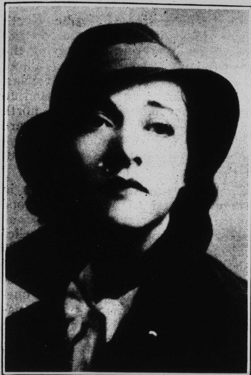
Jessie Royce Landis