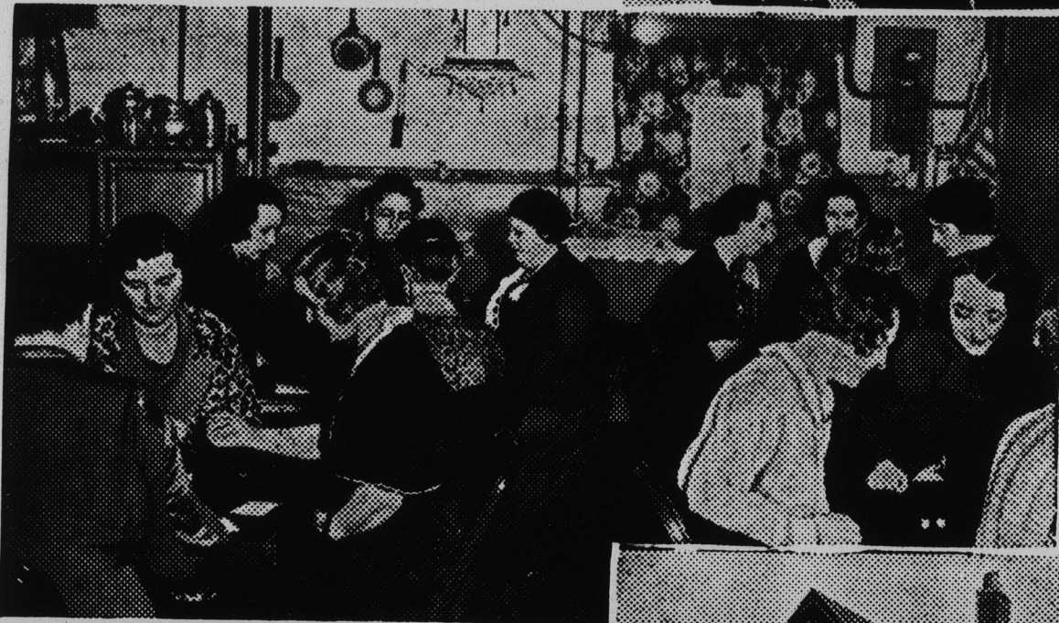
The camera catches a Woman's Club meeting in the Heinekamp basement. This club meets frequently in the Heinekamp's new basement room which clean, automatic gas heat made possible.