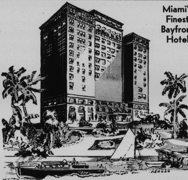
Miami's Finest Bayfront Hotel