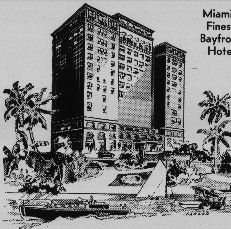
Miami's Finest Bayfront Hotel