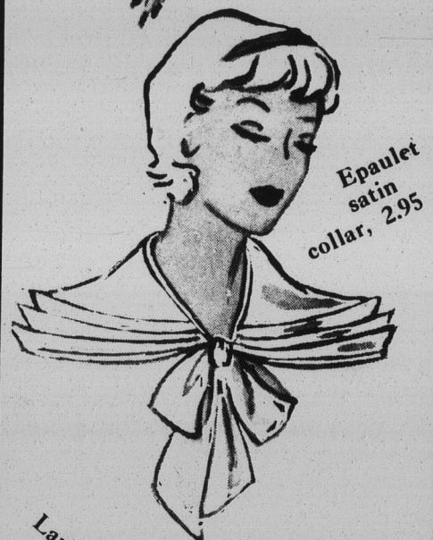
Epaulet satin collar, 2.95