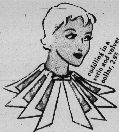
cuddling in a satin and velvet collar, 2.95