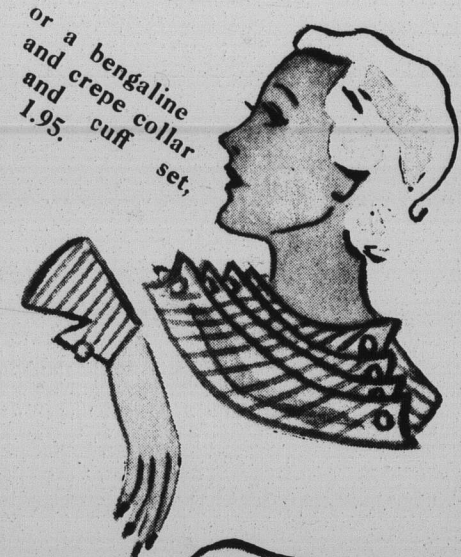
or a bengaline and crepe collar cuff set, 1.95.