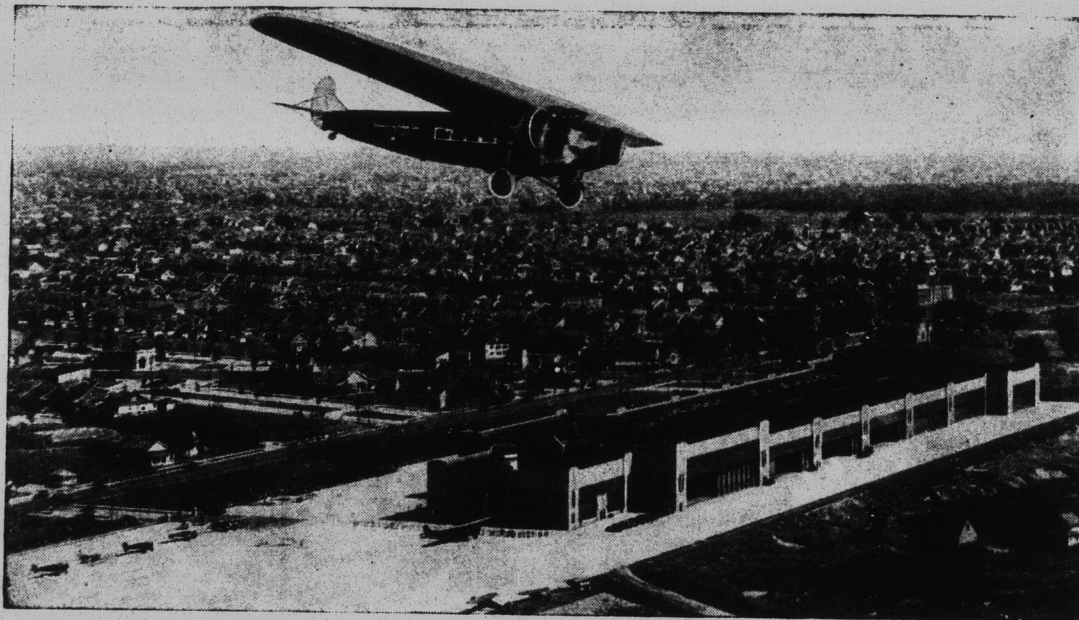
Eastbound Chicago Airliner Arriving at Detroit