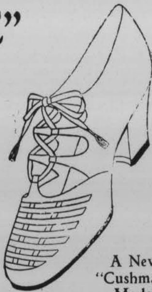
A New "Cushman" Model

This fascinating new shoe is sure to be the hit of the season with the younger set. Its features are! Full round short vamp! Basket weave effect of narrow interwoven strips of leather! And open instep formed by three narrow straps, set wide apart, and fastened with silk lacings.