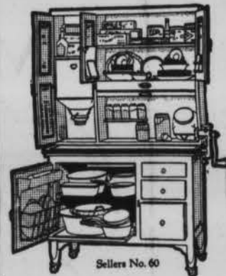
Sellers No. 60

Nationally Advertised Fifteen Famous Features