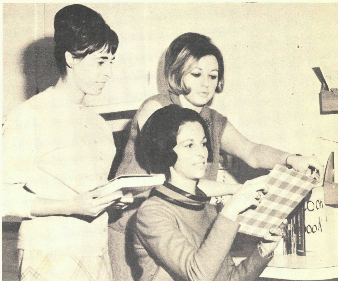
Searching for an old-fashioned recipe for Romona School's Pancake Day Sunday are Mrs.