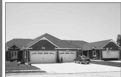
124 KIMBALL DRIVE

OPEN HOUSE Tues., Thurs., Sat. & Sun. 2 - 4 p.m.