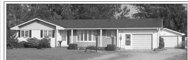
EDGE OF ESSEX, OVER 1/2 AC., 3 BDRMS, 2 BATHS, NEWER KITCHEN, FURNACE, C/A, SHINGLES, FLOORING, ATT. 1 1/2 C.GAR, PLUS 2 C.GAR., CALL RUTH ANN

433 CO. RD. 34 (NORTHRIDGE) REDUCED $20,000. NOW $179,000. 3 BDRM FULL BRICK RANCH, FULL BASE/T. BEAUTIFUL ORIGINAL HARDWOOD, TRIM AND DOORS, UNFIN. 2ND FL., 2 DOUBLE CAR GARAGES CALL RUTH ANN