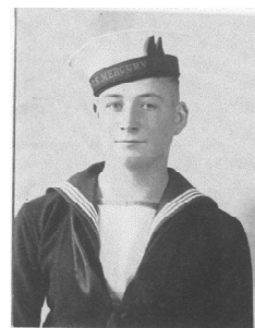
Age 14, Boys Nautical Training School