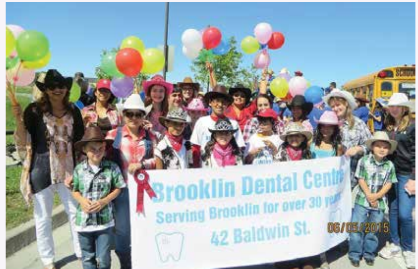
Staff, patients, family and friends of Brooklin Dental Centre at the Brooklin Spring Fair Parade

He is a member of the Ontario Dental Association.