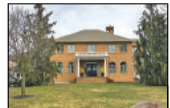
15 DODGE DR., BROOKLIN For virtual tour and additional listings please visit us online!