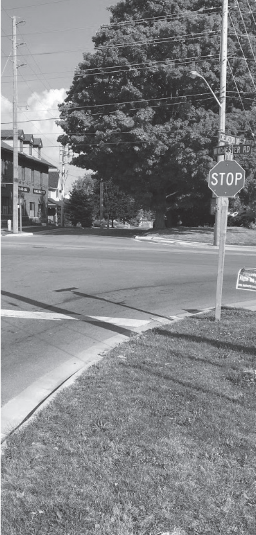
A view looking north of the Chelmsford/Durham/Winchester intersection.