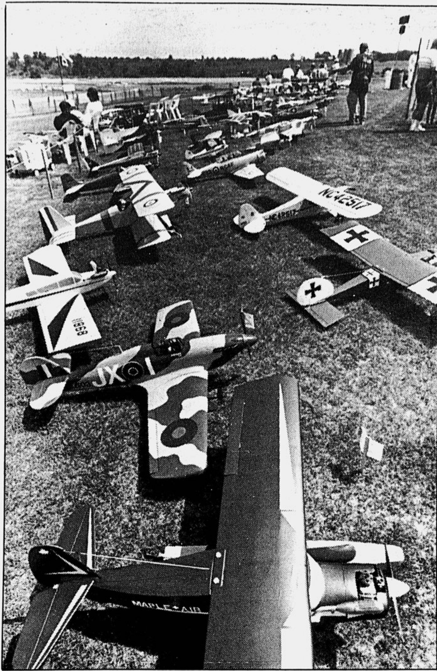
WHITBY AERO Modellers held a flying demonstration and display at Heber Down Conservation Area on July 1. With some of the proceeds from a videotape the club made about the 'Great Canadian Flying Circus' at Heber Down last year, $500 was donated to Heber Down. The funds will go toward the establishment of a play structure for disabled children.