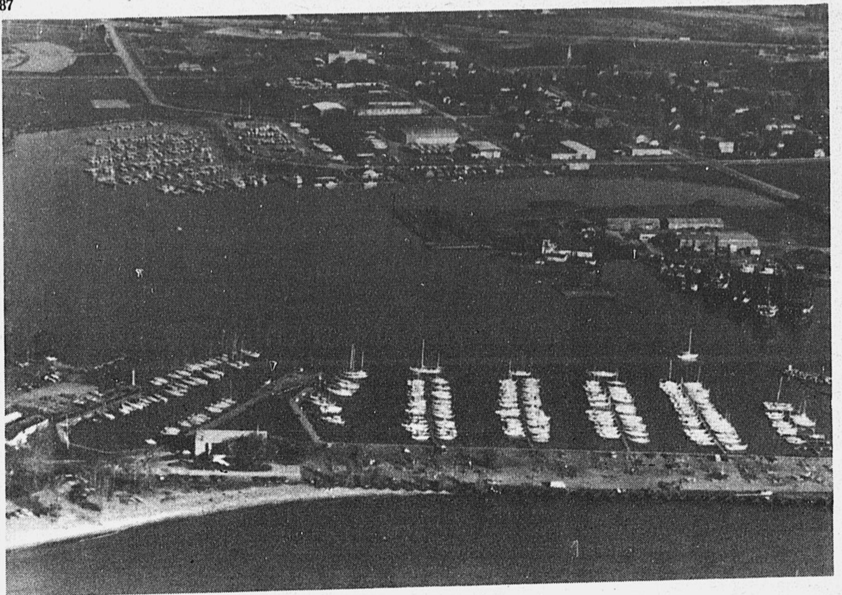
Whitby harbour and marina

Being a valued member of the local community is also an important part of the operation of DuPont's Whitby site. Through wages, salaries and local purchases, the site contributes to the local economy. Many employees make personal contributions of their time and money in support of community activities. It is the intent of DuPont Canada Inc. and its people to work hand-in-hand with the community to continue to make Whitby a better place to live.