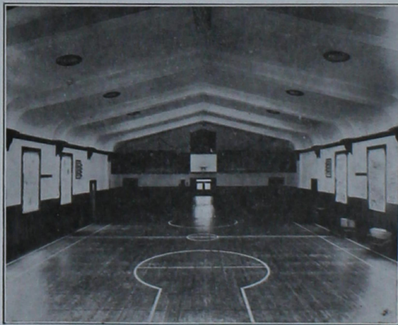
THE AUDITORIUM OF INGLEWOOD SCHOOL.

Line a plate with rich crust and fill with dates, stoned and cut, fine, mixed with the grated rind and juice of a lemon, sugar to taste mixed with a spoonful of flour, four tablespoonfuls of water. Add a top crust and bake.