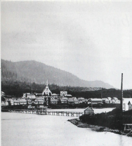
Fort Simpson as it was

Meilleur's work was resurrected, recognized as a lost classic of Canadian history. Raincoast Books decided to reissue A Pour of Rain . This new edition has been modified with language that is more culturally sensitive as much of the material deals with the native peoples of the area. It also includes a brief update of the status of Port Simpson, now called Kw'waka'wakw, and a stimulating foreword by well-known journalist Stephen Hume who refers to Meilleur's "eloquent, beautifully modulated literary voice" and calls A Pour of Rain "a document of great importance to British Columbians."