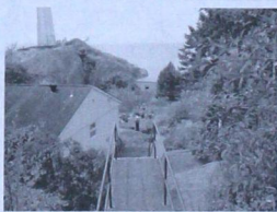
VIEW TO BLOCKHOUSE PAGE 11