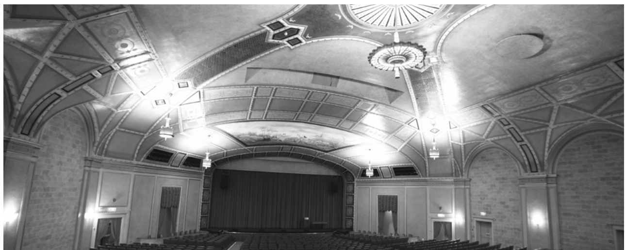
The Sanderson Centre for the Performing Arts, Brantford, Ontario