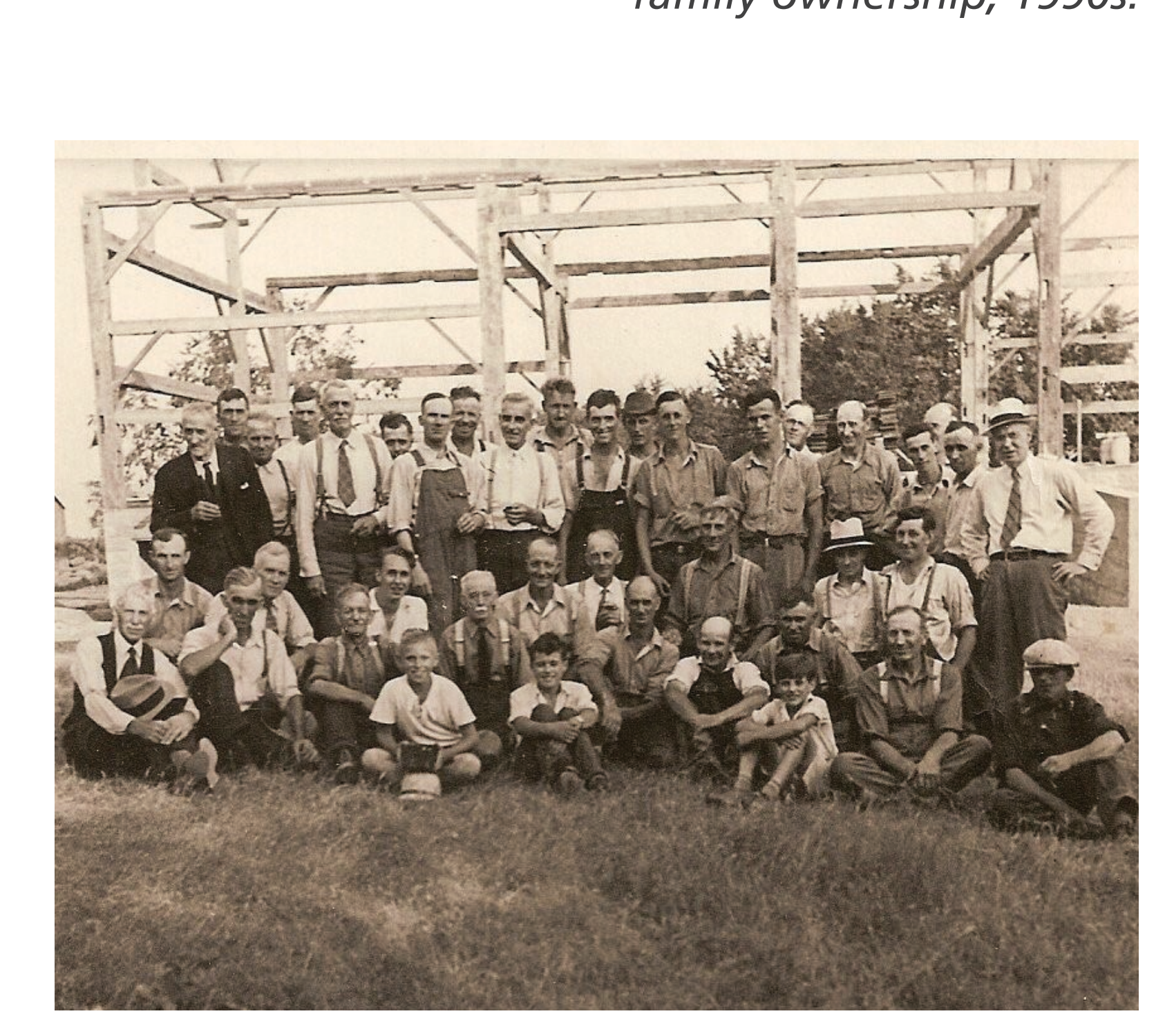
The Fleming Barn being raised, 1939.