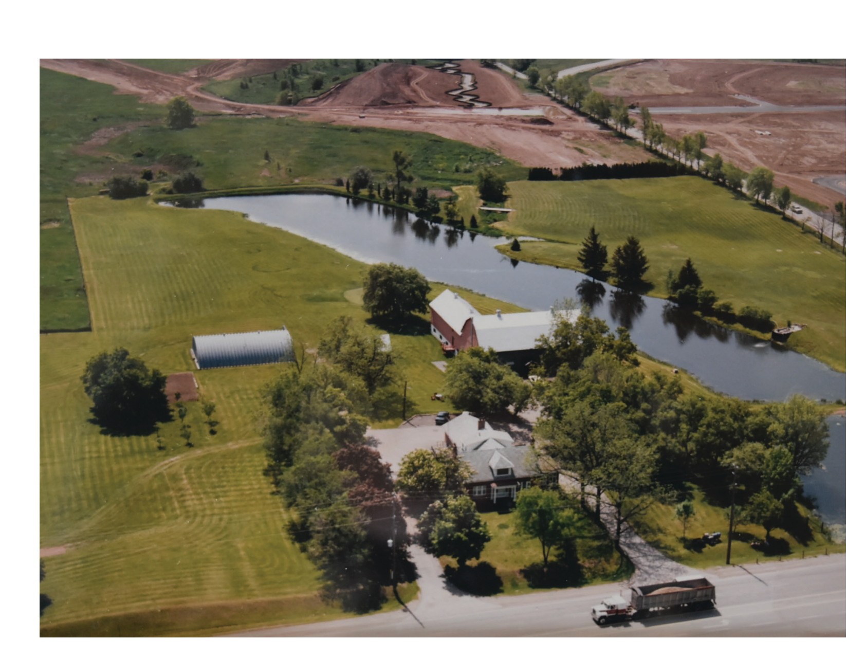
Aerial view of the farm under Hays family ownership, 1990s.