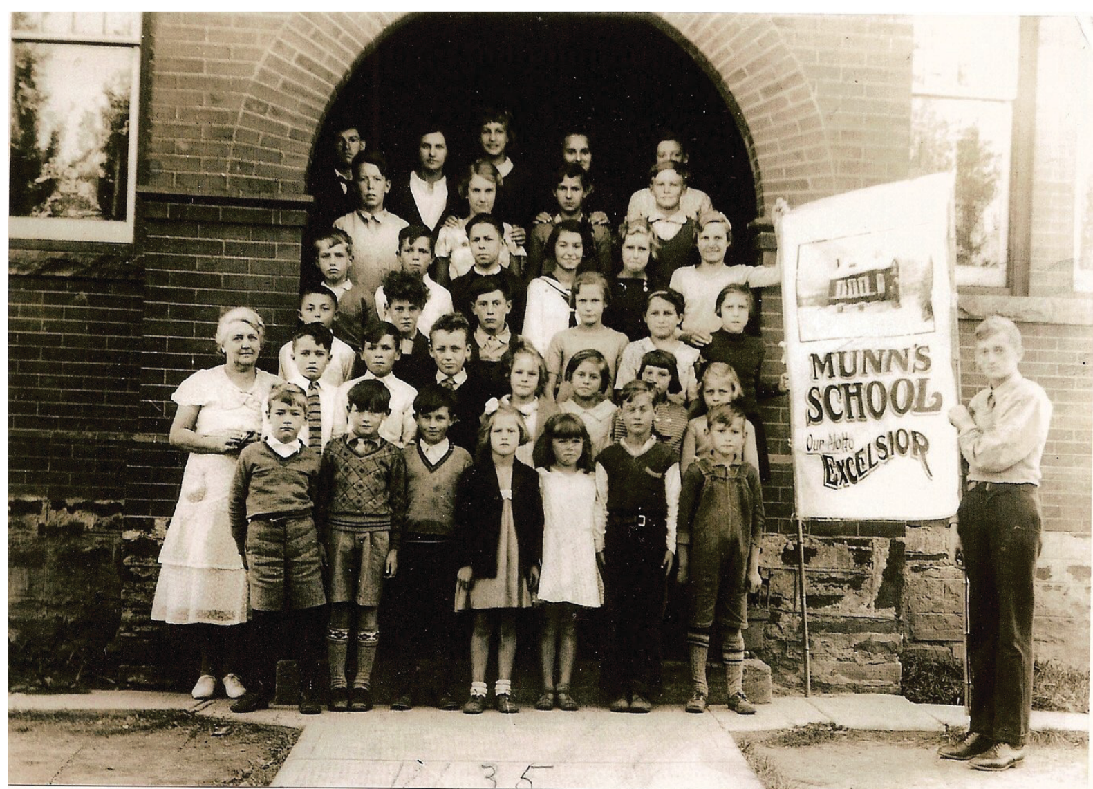
Munn's School graduating class of 1935.

Visit oakville.ca and search "heritage and history" to learn more about the history of Oakville.