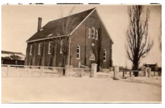
TTHS archive photo of Munn's Church, taken by a member of the Biggar family between 1910-60.