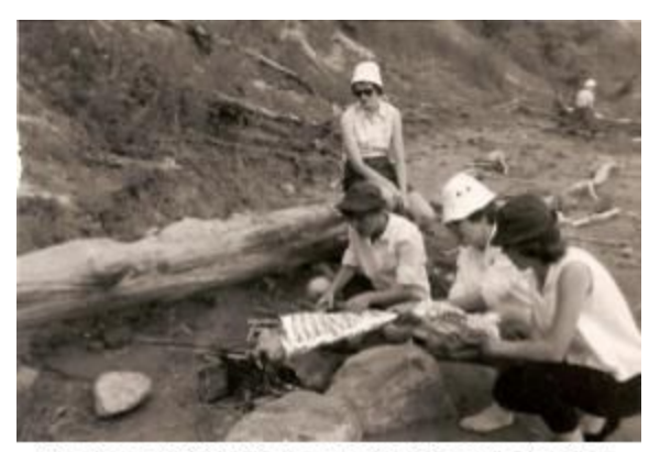
Cookout at Oakville Recreation Commission Day Camps, July 1959.

Prior to camp starting in July, the teenaged leaders went first to Fisher's Glen Leadership camp in Norfolk County on Lake Erie for training. This camp itself has quite a history, which is explored in the TTHS online collection. To view the this collection, visit the TTHS archives in the Palermo Schoolhouse or view the <a href="https://doi.org/10.1101/journal.org/">TTHS online collection through OurOntario.</a>