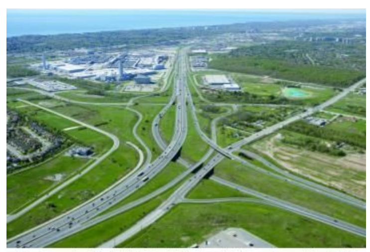
Photograph of Oakville's Ford Plant and Intersection of the QEW, Ford Drive and Highway 403.

Close to 300 high resolution, colour aerial photographs from 2002 and 2005 have been shared with the TTHS by Carolyn van Sligtenhorst, Heritage Planner, District East/Central Planning Services, Town of Oakville. We wholeheartedly agree with Carolyn's thought that the photographs in our collections should be visible and available. The images were taken for the Town of Oakville by BP Imaging. There are too many photographs in this collection to show all in our digital collection but a selected few have been uploaded to pique your interest. All the