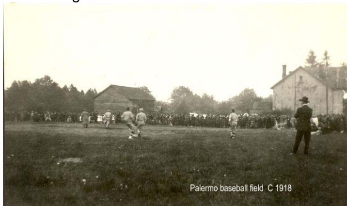
Palermo Baseball Field