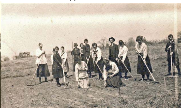
Garden behind Schoolhouse - either Palermo or Tansley School