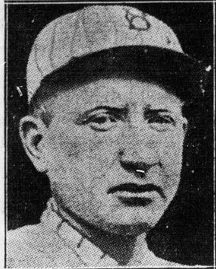
"DADDY" VANCE TRIUMPHANT "Daddy" Vance, of Brooklyn did the trick for the first time this season when he struck out 7 batters and retired 15 Giants in the last five innings, Brooklyn defeating the New York Giants 4 to 3.