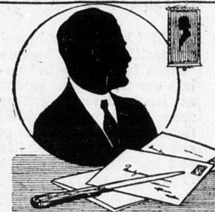
THE MALE AND HIS MAIL

are both worth studying. The average business man has ideas of his own as to his stationery needs both for office and home, and we cater to his desires and provide for both ends of his demands. Providing the choicest qualities, and largest assortments, we adjust prices to please.