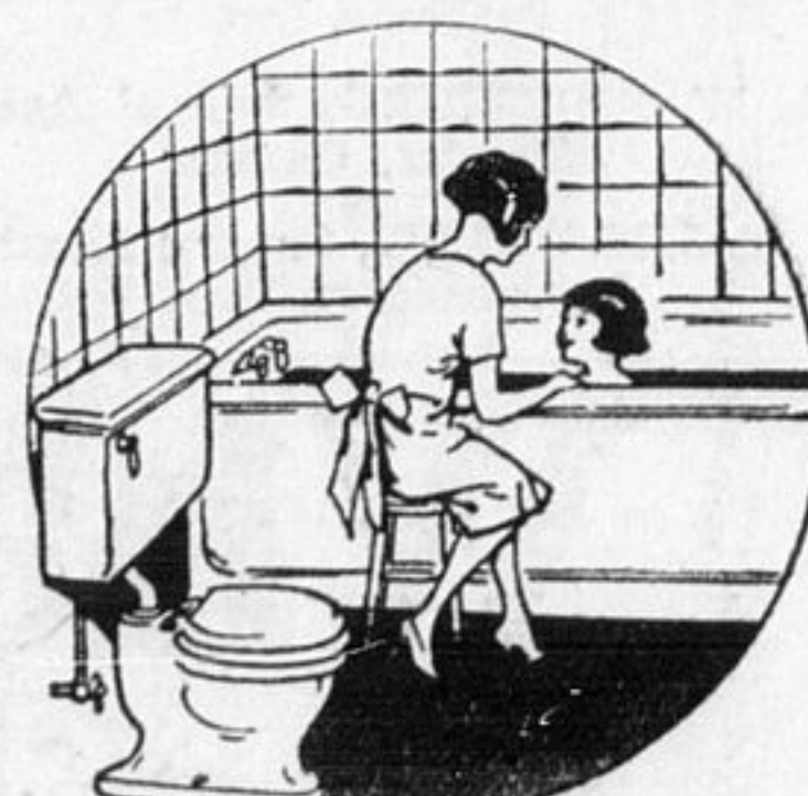
MODERN PLUMBING INSURES HEALTH

F. M. BURKE, LTD. DRUGGISTS AND STATIONERS Phone No. 7 Pine St. N. Near Post Office