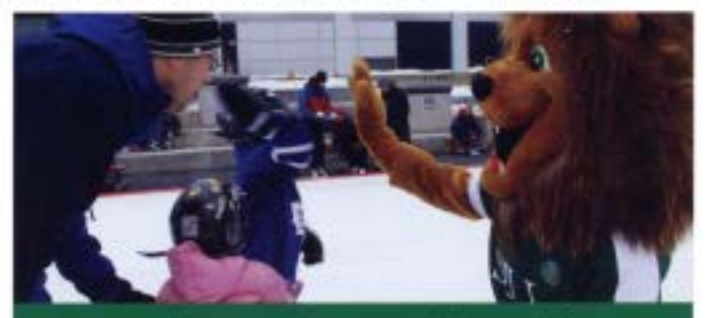
SJU Alumni "Sweetheart" Family Skate

For information on how you can get involved or be an alumni presenter, please contact Nadine Collins at nacollins@uwaterloo.ca or 519-884-8111 ext 28255.