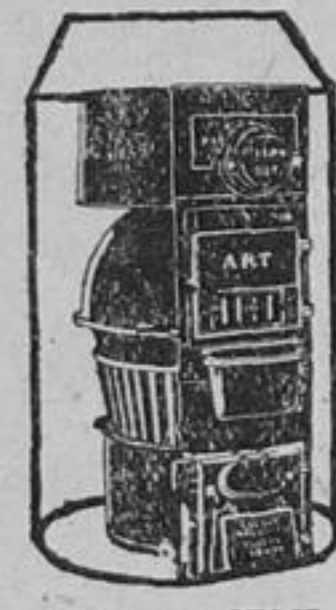
CAST and SEMI-CAST FURNACES

Gilson All Cast Furnaces! A big over-sized furnace at a record low price! We install quickly at small cost with money-back guarantee of quality from manufacturer. Pipe or pipeless models on easy terms.