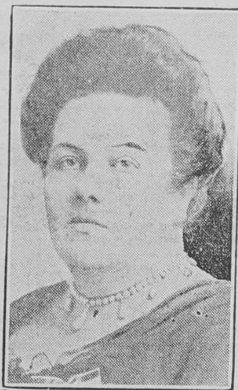
A Belgian Princess

"Soon afterwards we witnessed six French and Belgians, who had refused to comply with a similar re-