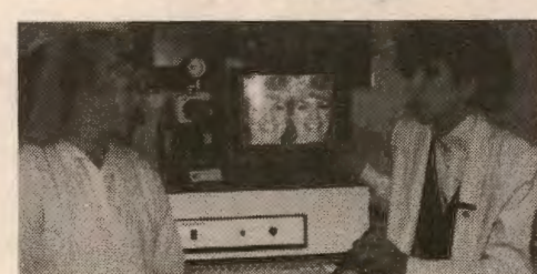
COMPUTERIZED COSMETIC IMAGING

PERIODONTAL TREATMENT (CLEANING & SCALING)