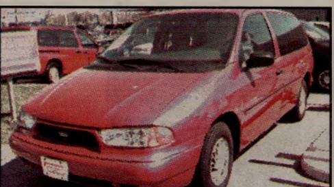
1998 WINDSTAR GL

1 owner, quad capt. chairs, alloy wheels, compact disc, power group, quality cert.