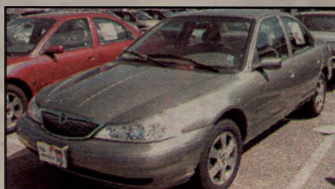
1998 MERCURY MYSTIQUE

X-Rental, ABS, power group, sport group, automatic, quality cert.