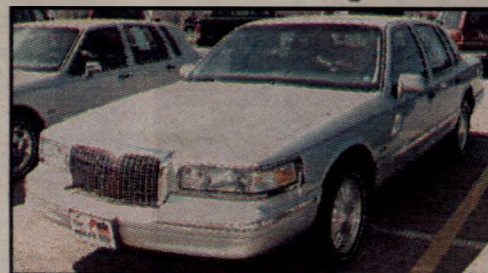
1997 LINCOLN TOWN CAR

1 owner, Cartier Series, moon roof, cell phone, CD changer, quality certified.