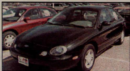
1997 FORD TAURUS

1 owner, Anti Lock Brakes, remote entry, power seat, low kms.