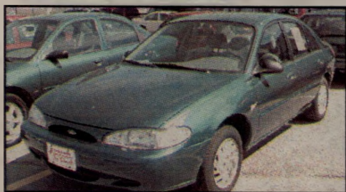
1997 FORD ESCORT LX

Quality CERTIFIED AND OAK-LAND CERTIFIED PRE-OWNED VEHICLES