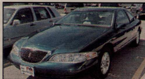
1997 LINCOLN MARK VIII

1 owner, 28,800 kms., leather, remote, keyless entry, 4.6 litre DOHC V8 engine, quality certified.