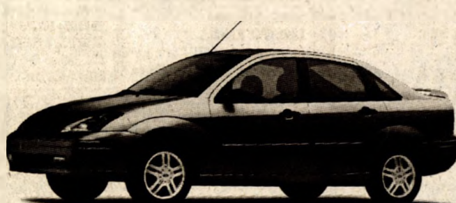
Focus SE Sport