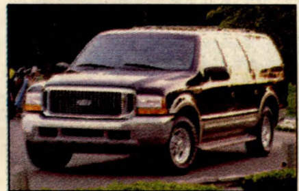
2000 Ford Excursion