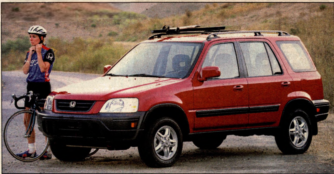
2000 Honda CR-V