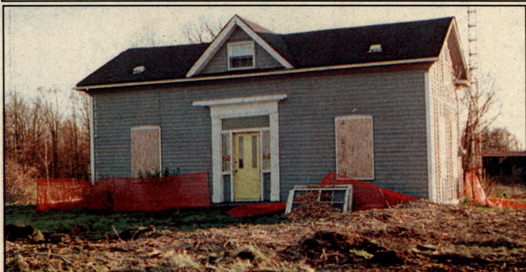
Historic home is in the path of the new Hwy. 407 ETR extension, so it has to go. The asking price is just $5,000 but the successful buyer will have to move it off site.

An Oakville Beaver Feature To reach this section call 845-3824 Fax:337-5567