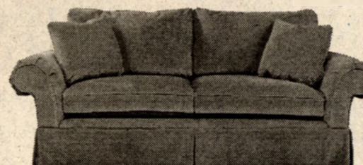
Sofa. Reg. $1224 $899