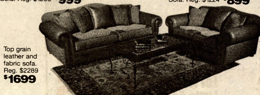
Top grain leather and fabric sofa. Reg. $2289 $1699