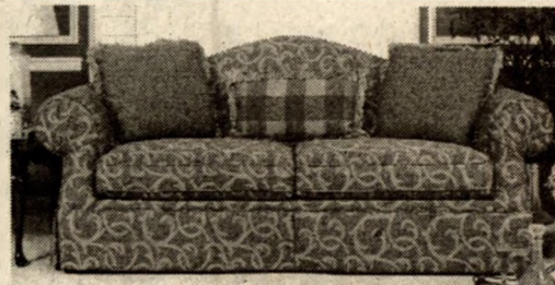
Sofa. Reg. $1296 $999