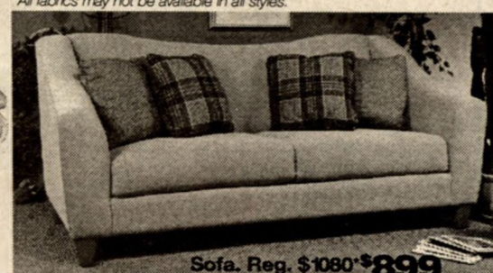
Sofa. Reg. $1080 $899