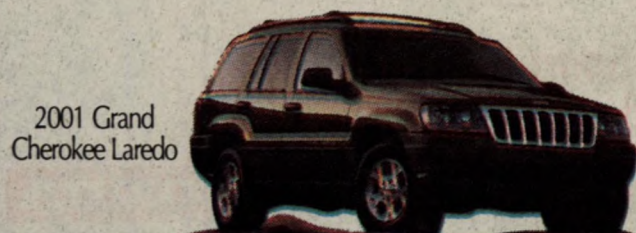
2001 Grand Cherokee Laredo