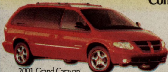
2001 Grand Caravan

Come and see the new innovative designs for the 2001 models and take one for a test drive today. Enjoy new refined styling with a palette of sophisticated colours to choose from at Lockwood Chrysler.