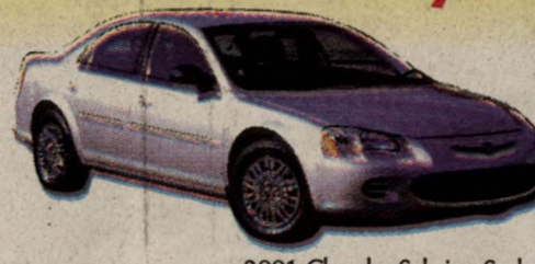
2001 Chrysler Sebring Sedan