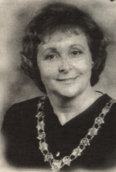
Mayor Ann Mulvale

Mayor Ann Mulvale was the initial recipient of the ATHENA AWARD in 1997. One nominator described her as (embodying) what ATHENA is by nurturing and caring for the community. Mayor Mulvale encourages people to recognize the empowering contributions of those who mentor and encourages others to excel by submitting nominations for the year 2000 Athena Award.