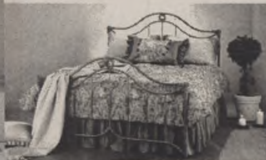
Queen size Montana bed. Reg. price, $1789.