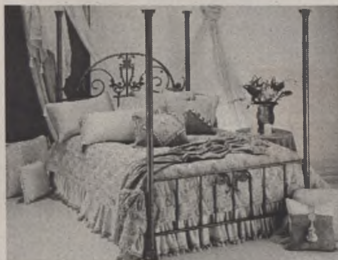
Queen size Corinthian bed. Reg. price, $3499.

Beautiful works of art handcrafted iron beds that will endure generations. Wide selection of styles and finishes. Available in Twin to King sizes.