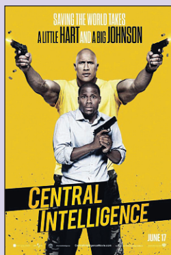
CENTRAL INTELLIGENCE (PG) JUNE 17TH