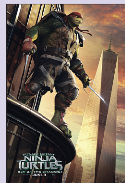
TEENAGE MUTANT NINJA TURTLES: OUT OF THE SHADOWS (PG) JUNE 3RD