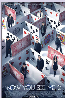
NOW YOU SEE ME 2 (PG) JUNE 10TH