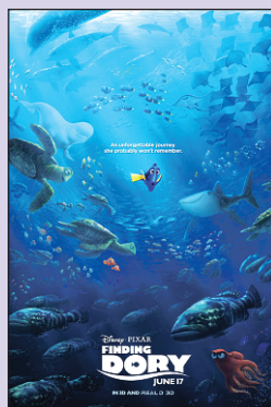
FINDING DORY (G) JUNE 17TH