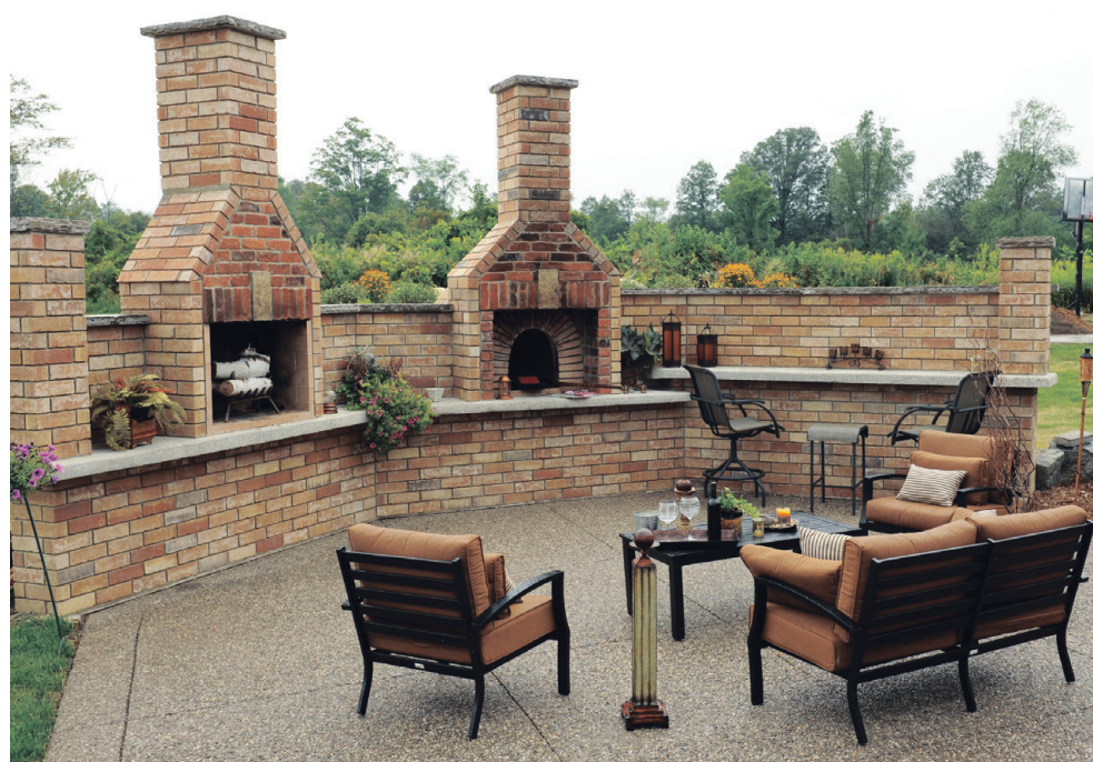
Sunmar Landscaping offers a wide variety of options to spruce up your outdoor entertaining space this summer.

For details on Sunmar Landscaping and to learn about their services, visit www.sunmarlandscape.com or call 905-842-7171 and book an appointment.