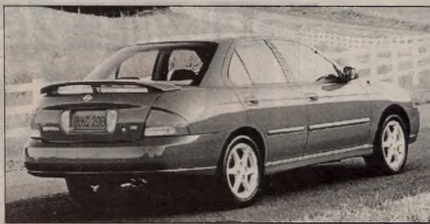
2001 Nissan Sentra SE

Forsyth said two goals drove initial development of the new Sentra: 1) tightly control costs by employing advanced technologies such as platform sharing and high strength Zone Body construction; and 2) then re-invest the savings in creation of a stylish and comfortable new-