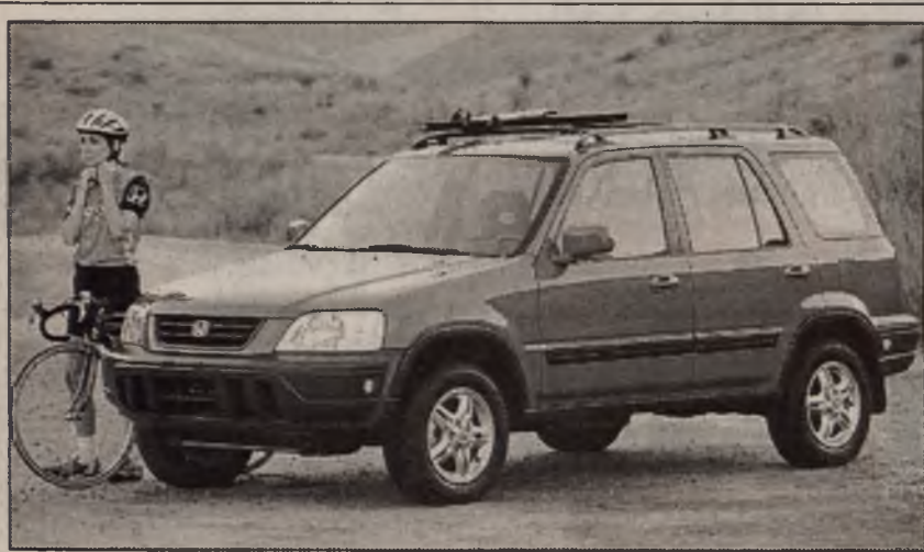
2001 Honda CR-V

A 60/40 split fold-down rear seat with locking seat backs is standard on all models. Three types of cloth are available, depending on model and trim levels.