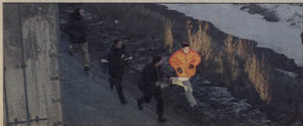
Curious onlookers run for safety after learning the leaking chemical from the damaged transport is flammable and dangerous.