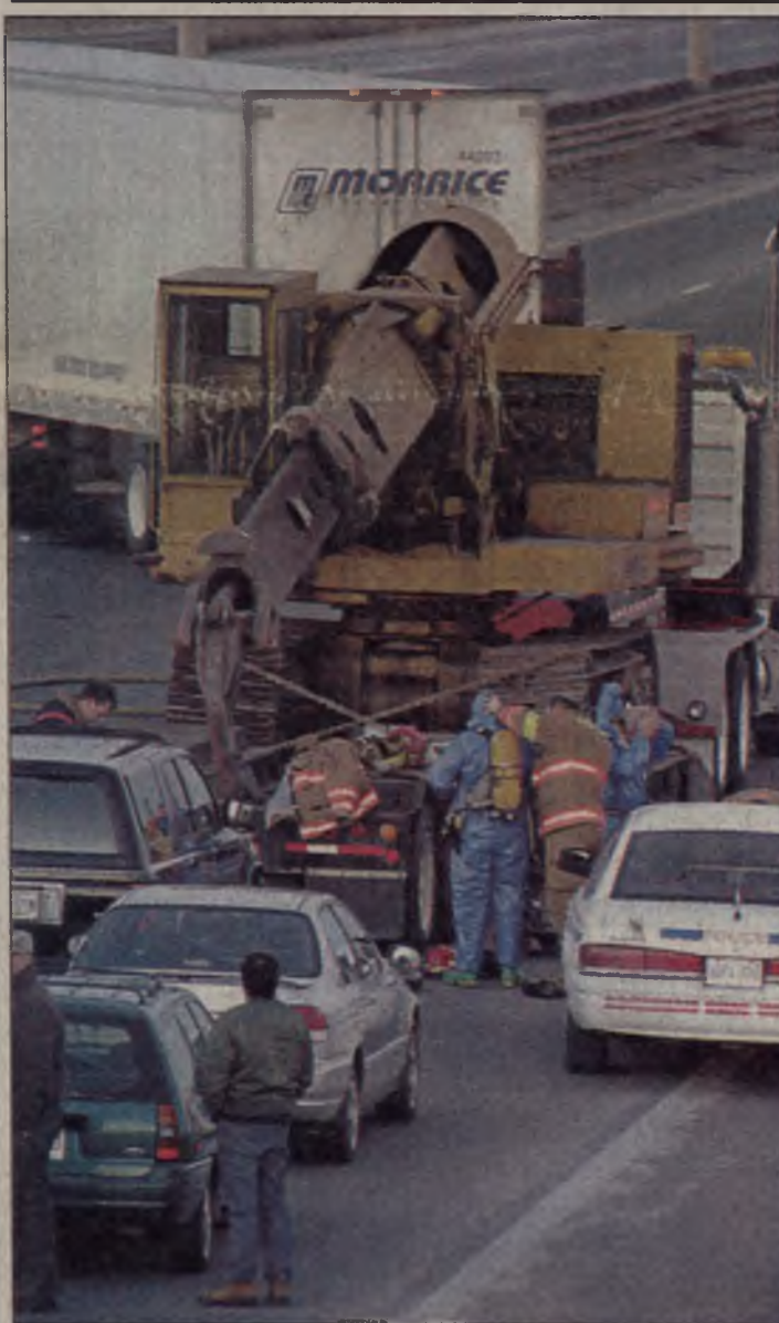
Members of the Oakville Fire Department's hazardous materials team suit up to contain the chemical spill.