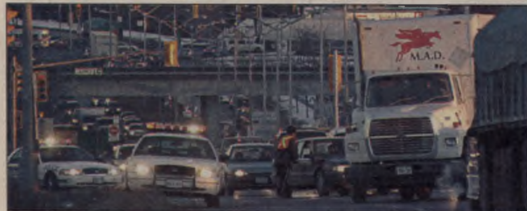
Northbound traffic along Dorval drive was brought to a standstill.

Traffic was also closed along Dorval between Speers Road and the North Service Road.