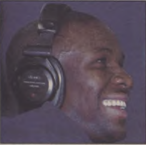
Donovan Bailey