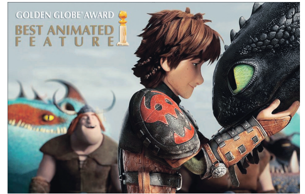
| Twitter photo courtesy DreamWorks Animation