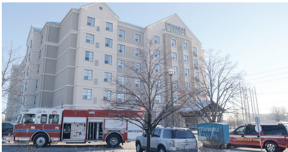
Oakville Fire and emergency crews were on the scene at the Staybridge Suites on Wyecroft Road, at Bronte Road, Wednesday morning, after the hotel was evacuated for a carbon monoxide leak.

The gas boilers in the mechanical room and the heater on roof were both shut off while Union Gas and the Technical Standards and Safety Authority (TSSA), a public safety branch of the Province, checked the equipment to determine