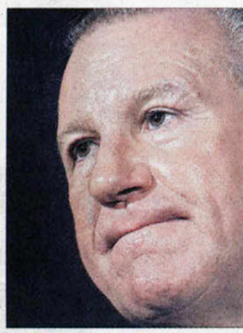
Barrie Erskine • Oakville Beaver

MPPs have argued they should have first crack to debate the budget the moment it's released